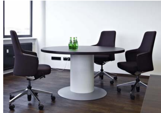
A lounge (left) exhudes a club atmosphere where drinks can be tested in an appropriately styled setting. Photos top: small conference situation with silent rush swivel chairs.