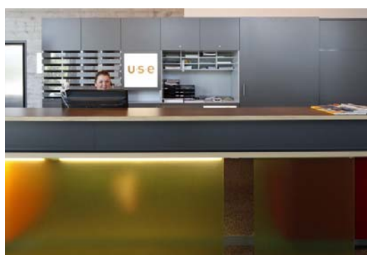
The way in which colour is used to accentuate parts of the interior supplements the neutral basic colour of the building, with its many views of the greenery outside.

The company U|S|E AG, which installs and integrates photovoltaic systems, has its new headquarters in a wave-shaped building that accommodates offices and storage areas under one roof. A bright atrium with plants also serves as a stairwell and provides indirect lighting for the storage areas. The spacious, flexible building structure supports growing and changing processes. Directed incoming daylight lends structure to the interior, whereby a "green centre" separates the open space from smaller office units. The office layouts in the open space area are designed to be flexible as the company, which is in a growth market and produces large solar installations among other things, is expanding rapidly. This means space for new staff is available and the entire space can be reorganised very quickly. Central zones promote communication and interaction due to their attractive furnishings.