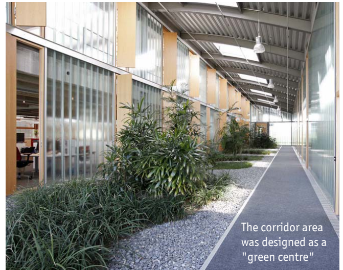
The corridor area was designed as a "green centre"